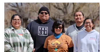
IBC's Student Life team—made up entirely of IBC graduates!