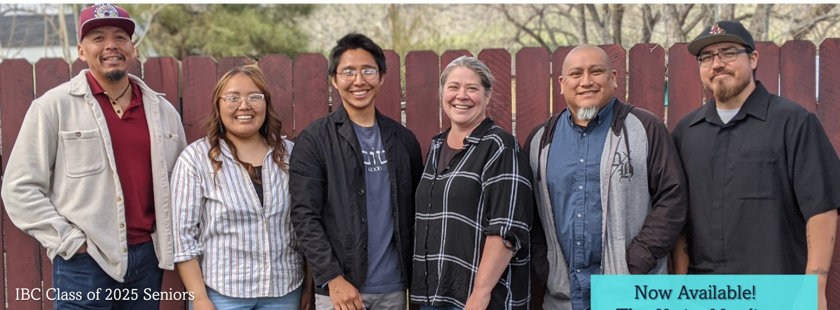
IBC Class of 2025 Seniors

A newsletter published by Indigenous Bible College (historically Indian Bible College)