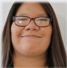
SKIE (continuing) Ojibwe Lake Vermillion, MN

Pray for growth and healing, humility in leadership, and refreshed relationships with God and people.