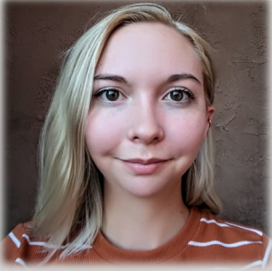
JIANNA (continuing) Anglo Gallup, NM

Pray for continued guidance for ministry opportunities.