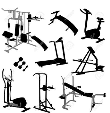
New Fitness Equipment for New Fitness Center ($5000)—Grants should cover most costs of the new equipment needed for this new facility, but we anticipate needing about $5000 more.

There are two ways to help celebrate Christ's advent by giving to IBC student needs: