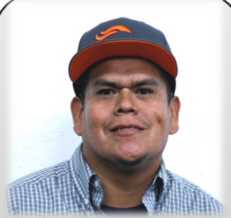
PHILEMON (continuing) Navajo Black Mesa, AZ

Pray for confidence in the power of Jesus.