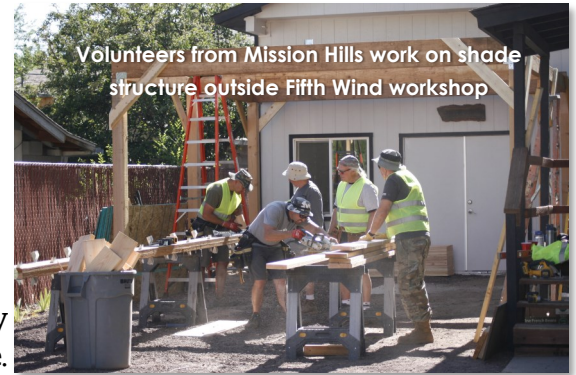
Volunteers from Mission Hills work on shade structure outside Fifth Wind workshop

Because many of our graduates will go on to serve in ministries which cannot pay a living wage, we are committed to graduating each of our students debt-free. Volunteers (including work teams) are involved at every level of the school's operations and are an integral part of keeping tuition costs low. Work teams are a major part of completing much needed maintenance and renovation projects. Labor and material costs for these projects are not passed on to the students.