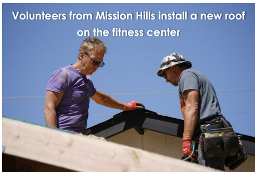
Volunteers from Mission Hills install a new roof on the fitness center

Kornell (our new facilities manager) and I enjoyed meaningful times with the work teams, sharing how God has been moving here at IBC. Many projects were completed including: new LED lighting, restroom remodel and new hardwood flooring in the administration building; new carpet in the classrooms and offices; a shade structure for the Fifth Wind work shop to allow students to work outside in good weather; in the Student Center a new sink and water heater, an outdoor grill/kitchen area with a shade over the patio area; and a new floor and new roof on the fitness center, which is still under remodel. In the housing areas we installed new landscaping and built a half block wall in addition to providing interior upgrades with new blinds, paint, doors, fridge, bathroom fixtures and a deep clean.