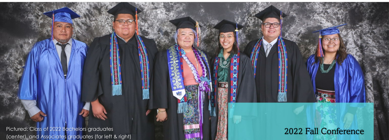
Pictured: Class of 2022 Bachelors graduates (center), and Associates graduates (far left & right)

A newsletter published by Indian Bible College of Northern Arizona