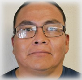
KORNELL (continuing) Navajo White Cone, AZ

Pray I would be humble, strong, and wise, an effective servant of God.