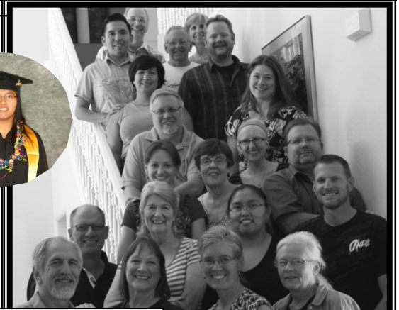
IBC staff, August 2015