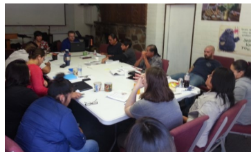
Student Leader Training

Please pray that God would continue to bring victory and spiritual growth on our campus following the recent crisis.