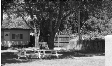
Common area between buildings

For years I have taught and counseled others that God's timing is not our own. Usually this means that our Lord develops things at a slower pace than we expect; our impatience is often our downfall. Every once in a while, however, the Lord's timing is sooner than we think or expect. This is the case in the area of our newly expanded campus. The need to grow the school was evident to me from day one of taking over the presidency in February 2009 but I never imagined it would come so soon—only 2 ½ years into my time of leadership!