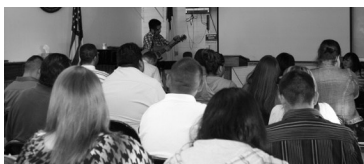
Chapel service this fall

We want to express our gratitude to all the volunteers who poured out